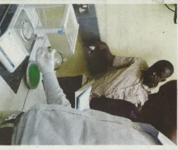
Calibration labs preparing for the mass inter-laboratory comparison.

KENAS established an Inter-Laboratory Comparison (ILC) scheme for high precision calibration laboratories in the country in cooperation with the National Metrology Institute (NMI). The purpose of this ILC program is to give confidence to the technical capacity of the participating laboratories and provide objective evidence about the technical competence thereto. The ILC Programme Protocol was prepared by staff of the two institutions and revised by an international technical expert.